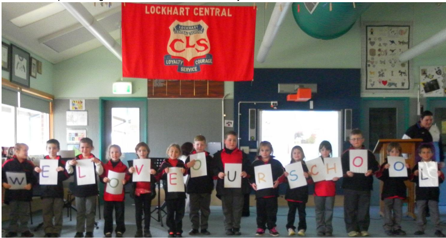
PHOTO: P1 presenting at our Whole School Assembly for Education Week.