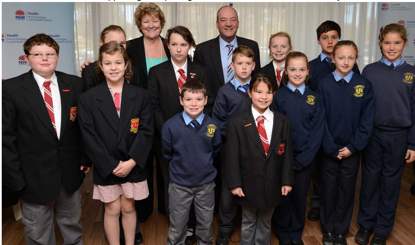
PHOTO: LCS students supporting the opening of the new Lockhart Medical Facility.