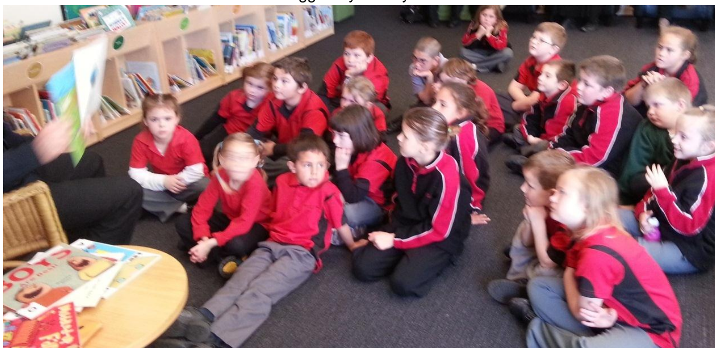
PHOTO: Book Week Excursion to the Wagga City Library.