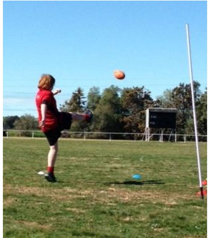
AFL Senior Boys