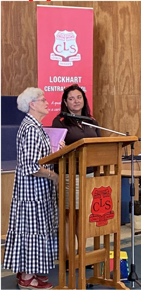
Book gift given to LCS